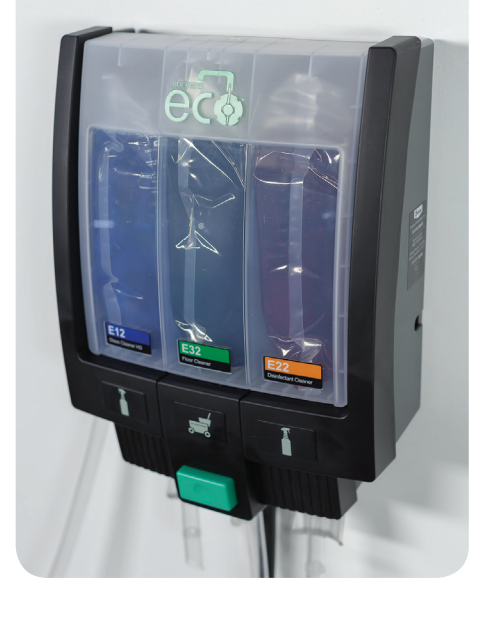
Remote locations Satellite locations Focused locations Up to 3 products